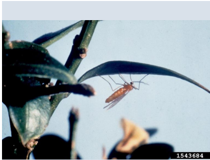
Boxwood leafminer adult