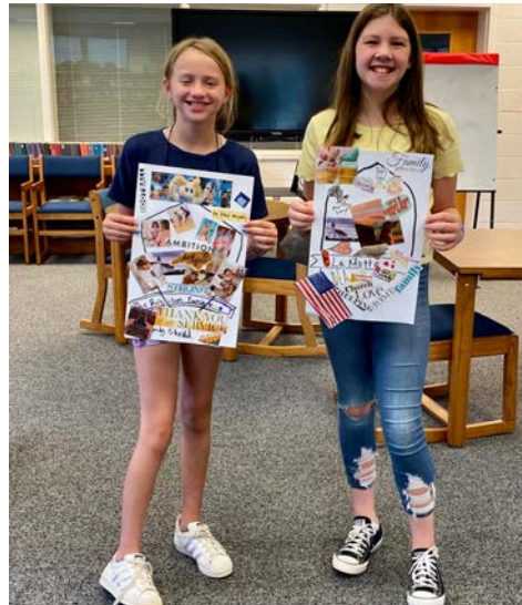
[L]: Families working on their family shield [R]: Youth participants showing their completed family shields

Recruitment has remained top priority through the month of September, but we've also been working on partner relationships. We've formed several new partnerships and have strengthened some that already exist.