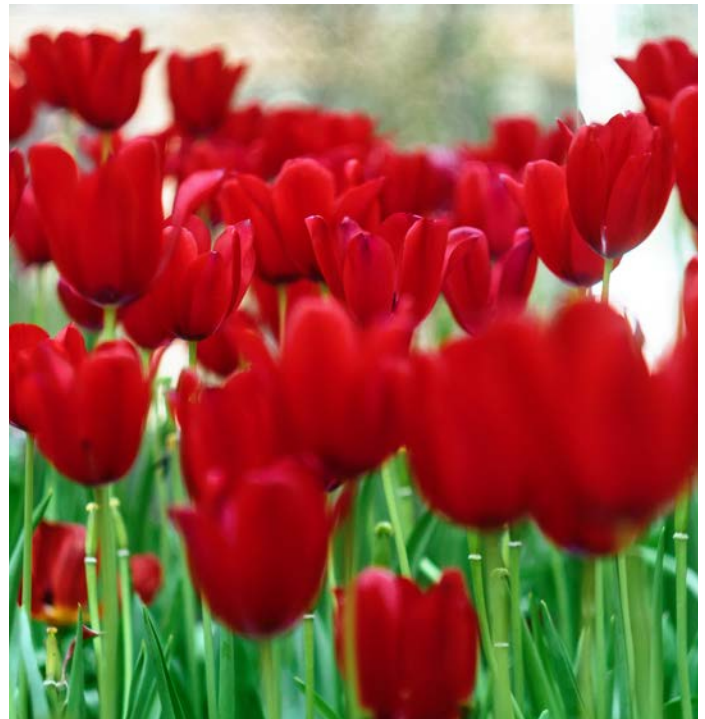
Red Ribbon Week