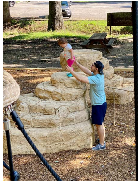
My youngest overlooking the success of her climbing adventure and dad standing there for mom's sanity.

As a caregiver of a child, regardless of age, their safety is generally the number one concern. The same goes for teachers, youth leaders, community volunteers, childcare providers, pastors, and anyone who has any sort of responsibility with youth. When it comes to middle-school youth, the safety concerns begin to be less about falling and breaking bones. Youth are now introduced to new friends, new experiences, and new substances. They feel as if they have something to prove, they're trying to fit in, and some just flat out experiment.