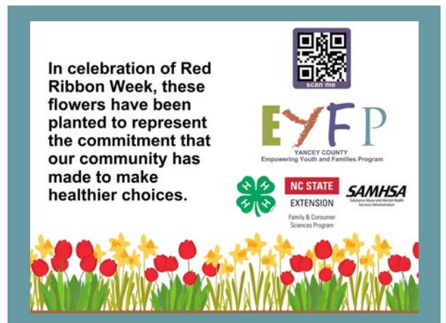
Signage to be placed in the flower beds at both participating middle schools

Red Ribbon Week is based on scientific principles for substance misuse prevention. Many, if not all, of these same principles are woven throughout the Empowering Youth and Families Program curriculum. These overlapping concepts provide a wonderful opportunity for those of us involved with EYFP.